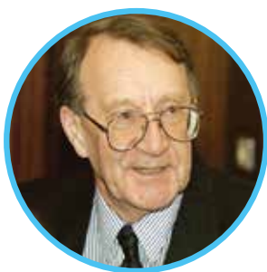
Roald Sagdeev , member of the Russian Academy of Sciences and US National Academy

I am so proud to address you at this very important event – opening of the prominent Olympiad. It is not surprising that this Olympiad is taking place in Baku, Azerbaijan. Baku is an example of a very fast developing city which devotes a lot of attention to science, education.