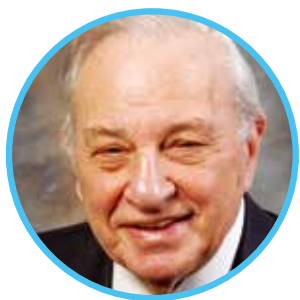
Rudolf Arthur Marcus , professor of California Institute of Technology, Nobel Prize Laureate in Chemistry in 1992

It is a pleasure to greet you in the 47th International Chemistry Olympiad in Baku.