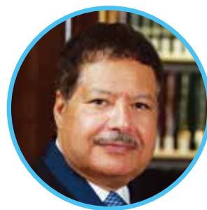
Professor Ahmed H. Zewail , Nobel Prize Laureate in Chemistry in 1999

I am so proud to address you at this very important event – opening of the prominent Olympiad. It is not surprising that this Olympiad is taking place in Baku, Azerbaijan. Baku is an example of a very fast developing city which devotes a lot of attention to science, education.