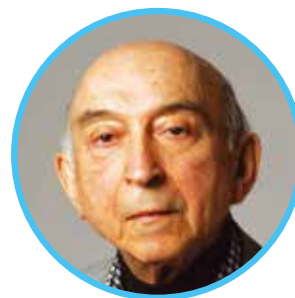
Lotfi Zadeh , professor of the University of California, famous Azerbaijani scientist

I should like to extend to you my warm personal greetings as one who was born in Azerbaijan and was deeply influenced by the culture of Azerbaijan and its rich history. Azerbaijan has been evolving into an increasingly visible and influential members in the international community. Holding the 47th Chemistry Olympiad in Azerbaijan is an important symbol of recognition of the remarkable progress which Azerbaijan has made and is continuing to make in developing science, technology and culture under the leadership of President Ilham Aliyev and other leading members of the government whom I was privileged to meet.