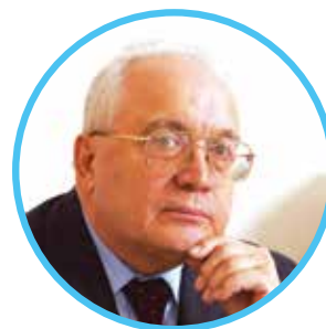
Viktor Sadovnichy , Rector of Lomonosov Moscow State University

Dear friends, participants of the 47th International Chemistry Olympiad On the day of Olympiad Opening I cordially congratulate each of you with this meaningful event in your life.